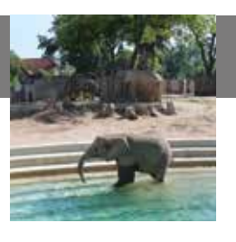
Address: Reilstraße 57

Around 1,700 animals covering more than 250 species from five continents live at the Bergzoo Halle. The site covers nine hectares and is located on Halle's Reilsberg, where winding paths meander past the animal enclosures all the way up to the lookout tower.