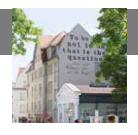
Große Ulrichstraße 50/51

This is where Halle's theatrical heart beats. The New Theatre, Halle Opera, puppet theatre, Thalia theatre and the Staatskapelle orchestra ensure audiences can always enjoy a diverse range of performances on the city's stages.