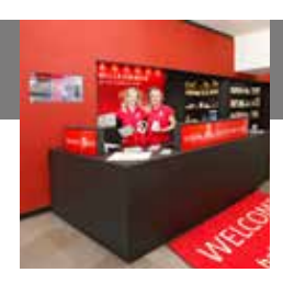
Address Marktplatz 13