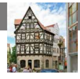
Address: Graseweg 6

A building with an eerie history: as the Black Death raged through Halle, infected victims were walled up here in the narrow street known as Graseweg. When the city's residents pulled down the wall ten years later, they found an overgrown street strewn with skeletons.