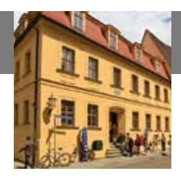
Address: Große Nikolaistraße 5

The birthplace of George Frideric Handel houses an exhibition about the life and work of the renowned Baroque composer. The collection also contains around 700 instruments from several centuries and 1.000 handwritten documents.