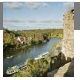
Seebener Str. 1 – Giebichenstein district around Bura Giebichenstein Kunsthochschule Halle

The area around the Giebichenstein crags is one of the earliest parts of Halle to have been settled. The upper part of the site has lain in ruins since the Thirty Years' War and is now an open-air museum, offering stunning views over the Saale river during the summer months.