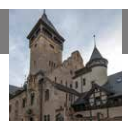
Design campus: Neuwerk 7 Art campus: Seebener Straße 1

Founded in 1915, the university now brings together more than 1,000 talented young people from many different countries. Halle benefits from a variety of exhibitions and installations thanks to the visionary thinking and design originating from the university.